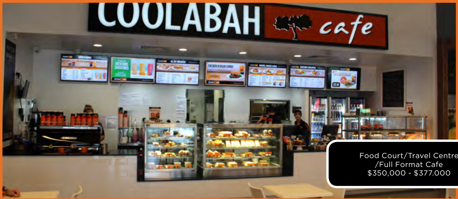
Food Court/Travel Centre /Full Format Cafe $350,000 - $377.000