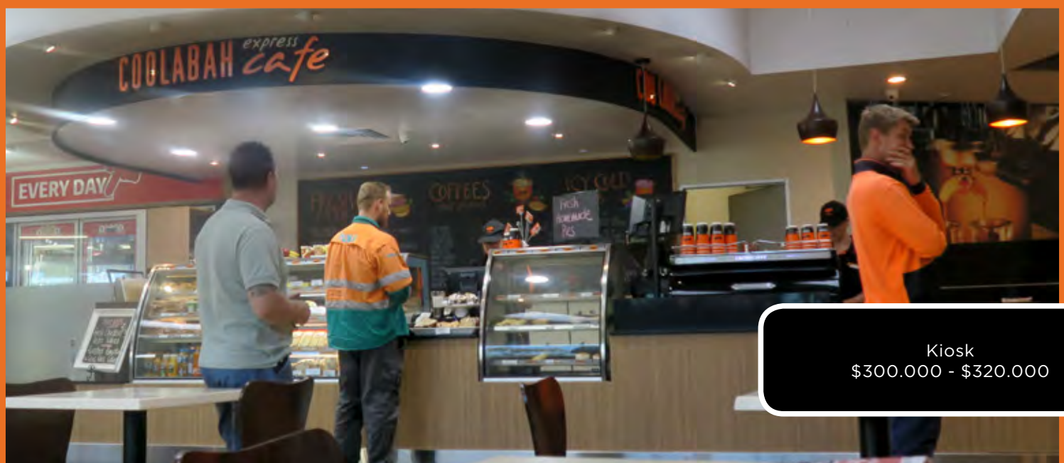
Kiosk $300.000 - $320.000